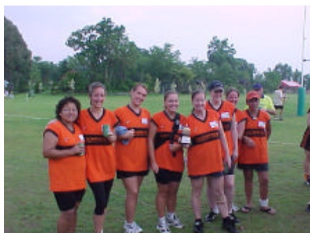
(Southern's Green with their Bowl)

The key clubs in Thailand include the Southerner's, Pattaya, British Club, Corsairres, and Phuket. Annual Womens Touch tournaments include Pattaya (as part of the Pattaya 10's) and Touch as part of the Bangkok 7's Rugby. A Southerner's tournament is being planned for October to coincide with the Bangkok 7's Rugby.