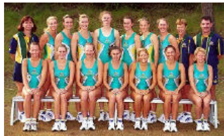
(1999 World Cup Team)

Continuing in the series of great teams of the 20 th Century it is hard to go past the Australian Womens open team who won all four World Cups to date.