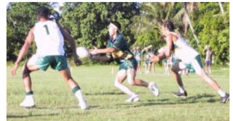
(Action from the Cook Islands)

Remember this newsletter belongs to YOU - the players, officials, and all the members of the World's touch fraternity. Send me your snippets, your articles any events, or your calendar, or any other items you wish published. The success of this newsletter will depend upon you submitting articles but more importantly assisting in the circulation of each issue to as many "touchies" as possible.